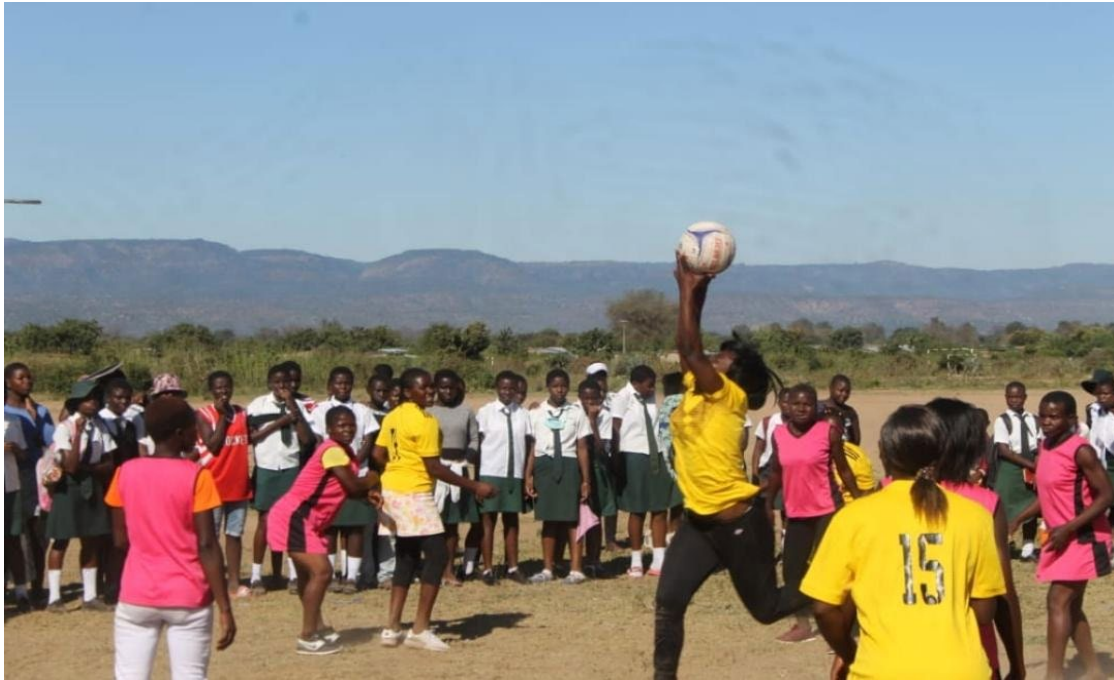
Sports for peace-Netball tournament in TRC.