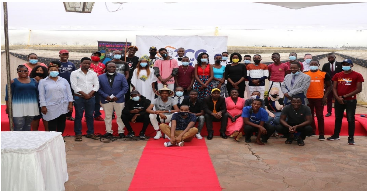
Above: ZCC Ecumenical Youth Arts Festival at Kentucky Hotel in Harare.