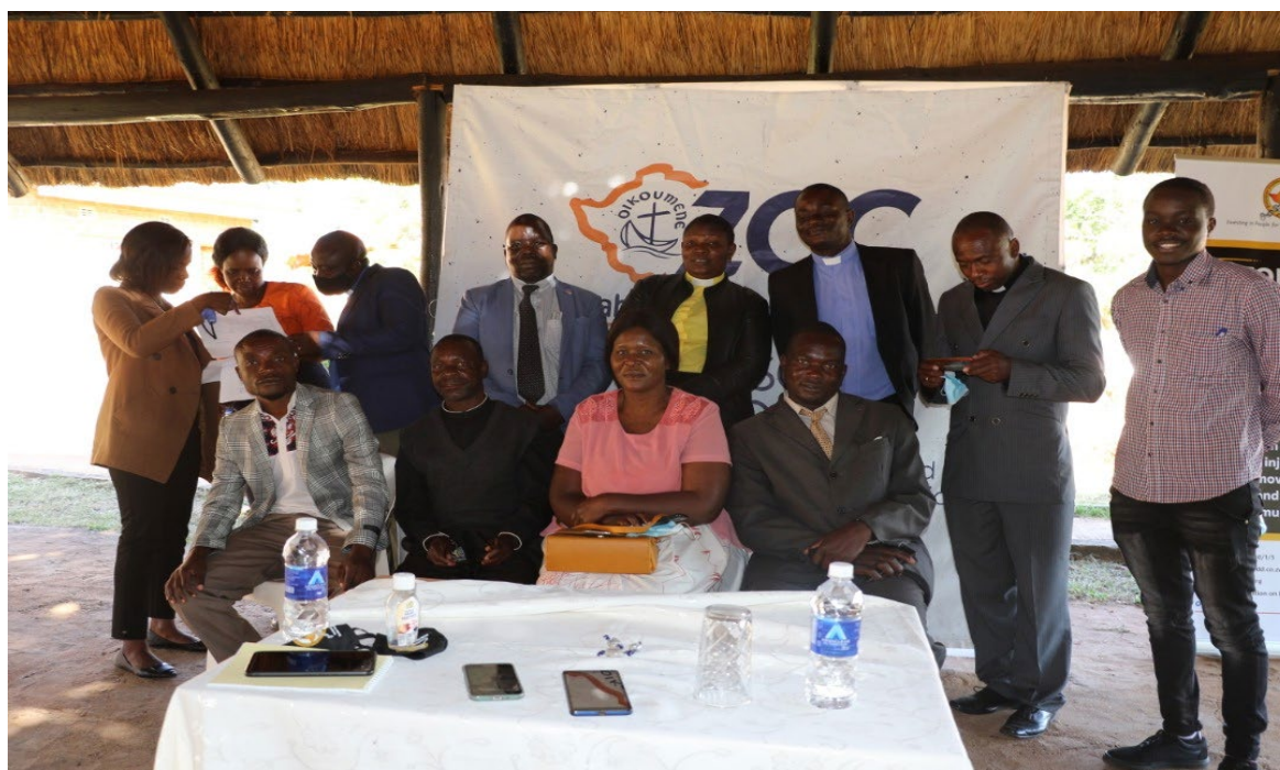
Above: Faith leaders and ZCC staff after a DAMI in Goromonzi-Acturus Area.

Campaign 1 .. ZCC also led the SADC Non-State Actor (NSA) Engagement in the Continental Free Trade Area Processes.