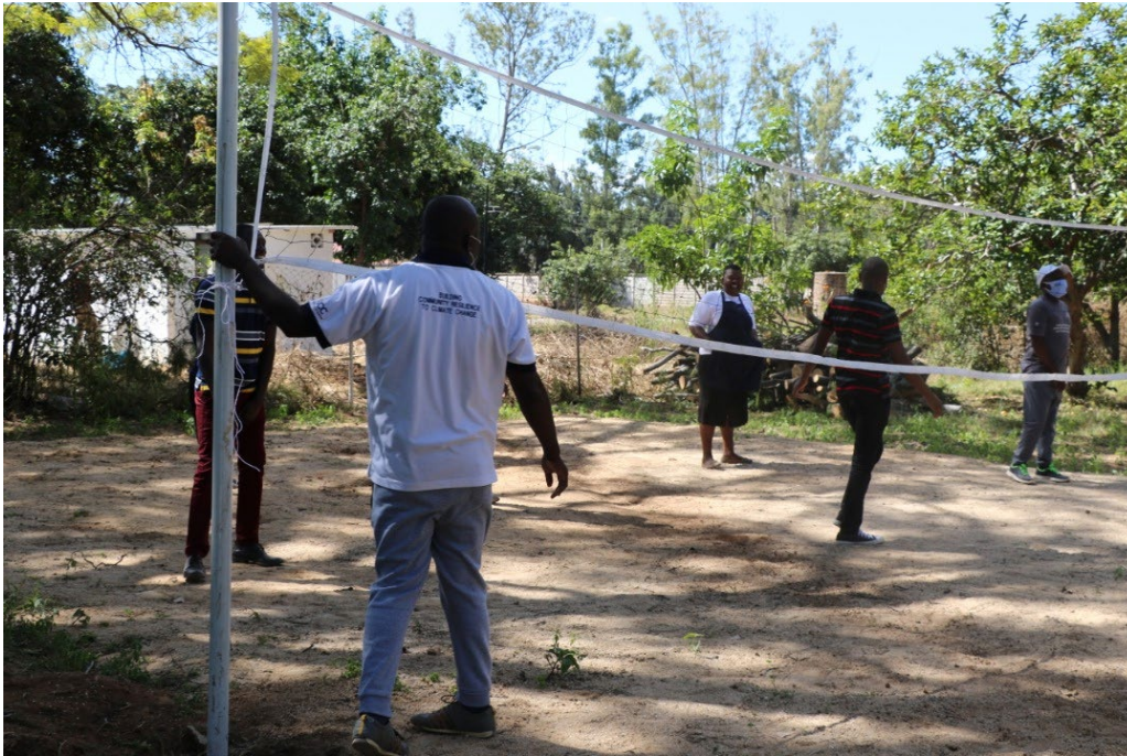
Figure 1 ZCC staff in action during the staff wellness Program in Harare.