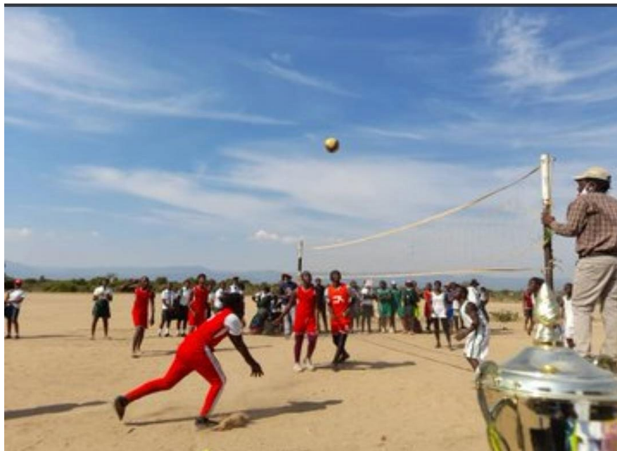
Above: sports for peace-volleyball tournament in TRC

Materials, the provision of hygiene kits to 300 young women and girls. The installation of a solar powered system has provided safe water to more than 14000 people in the TRC. Five Sports for Peace tournaments were conducted to create a peaceful environment in TRC.